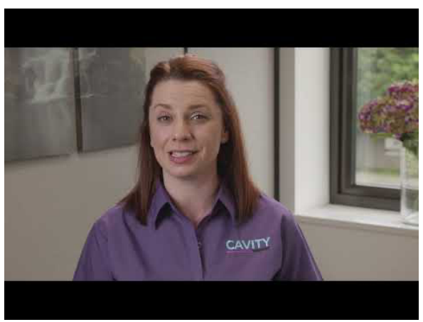
Check out our introduction to Cavity Training Video-

This interactive booklet provides an 'all you need to know' guide for learners exploring apprenticeships to further their career and education. We hope you find the answers to some of those important initial questions and helps guide you on the right path as you develop your own learning and skills.