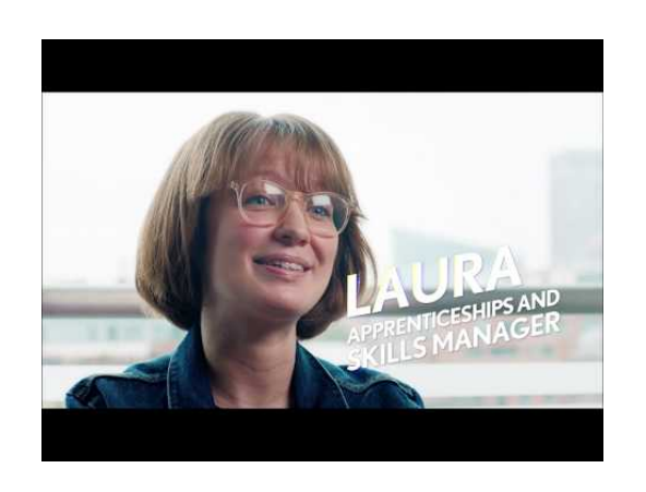
Channel 4 Click the film above or visit:

Find out more about the benefits of apprenticeships from three exciting employers by watching the films below.